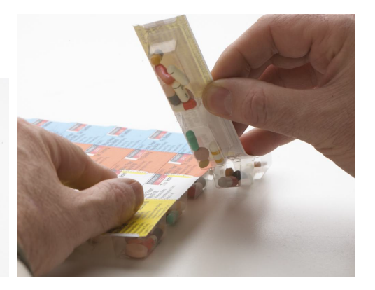
To separate the Dispill blister cells, simply fold them forward 3-4 times and pull them apart.